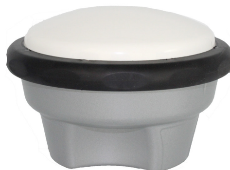
Part Number: 44830-10