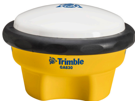
Part Number: 44830-00-INT